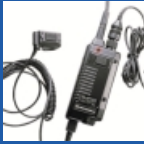
Ear Microphone System (Voiceducer)