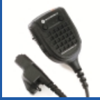
Remote Speaker Microphone

A comprehensive range of accessories is available so that the radios can be customised to suit your needs. Adding the proper headsets, microphones, batteries, chargers or carry cases can enhance the productivity of the people who use two-way radios. Motorola accessories are built with the highest quality standards and are specially engineered to assure maximum performance of your radio, no matter what profession you're in.