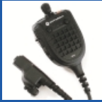
GPS Smart Remote Speaker Microphone