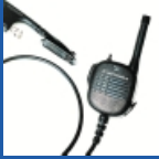
Public Safety Speaker Microphone