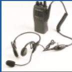
Temple Transducer Headset